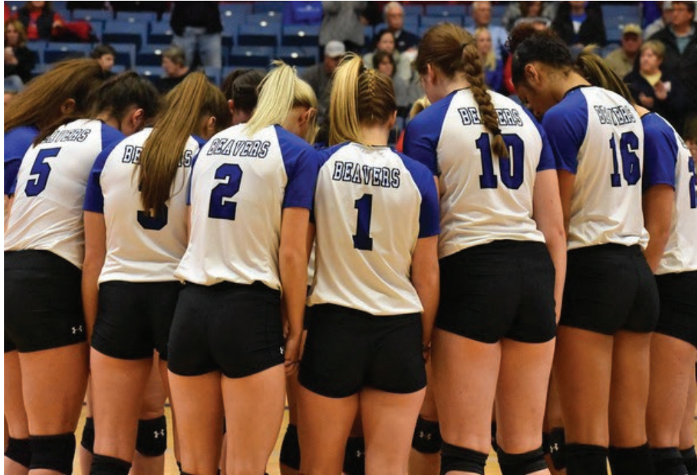
The Pratt Community College volleyball team huddles together in their last regular season match of 2018.