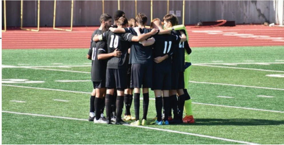
The Pratt Community College men's soccer team huddles together in their final game of the 2018 season.

PCC men's soccer will look to build on their accomplishments in the 2019 season. Stay tuned to gobeaversports.com for all men's soccer related news during the offseason.