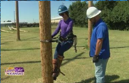
KSN.COM Pratt Community College's New EPT Program Pratt Community College offers one of the most comprehensive Electrical Power Line