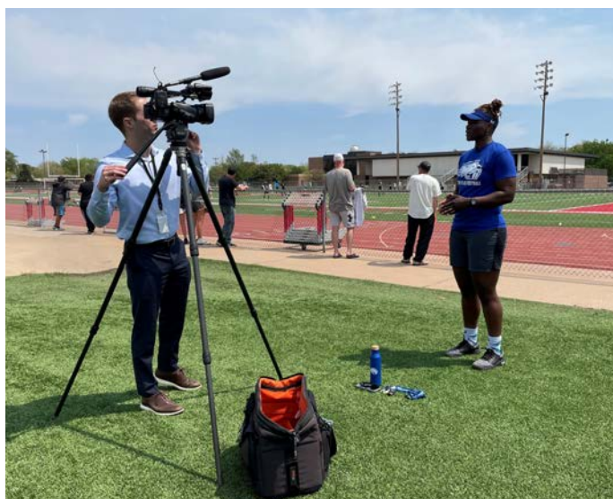
KSN News 3 Feature