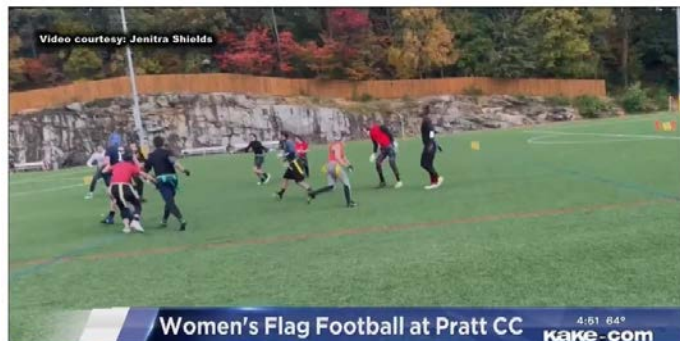
KAKE News 10 Feature