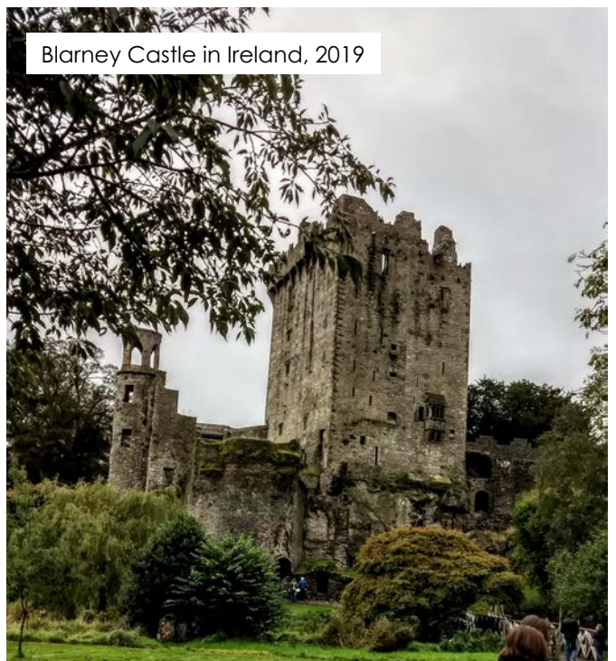
Blarney Castle in Ireland, 2019

The world is a book, and those who do not travel read only one page. St. Augustine. You learn a lot about other people, cultures and yourself when you travel.