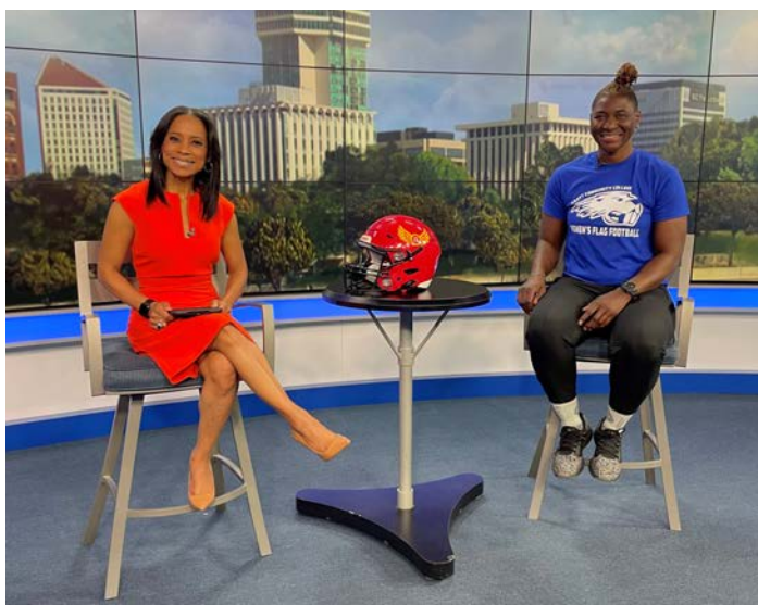
KWCH 12 Newstalk Feature