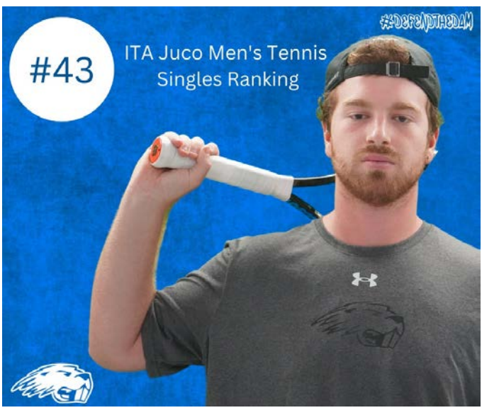
Congrats to the student-athletes included in the first ITA Juco Tennis Rankings of the season!