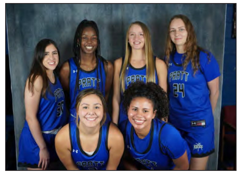
here for two years they have battled a lot of adversity. When you lose 16 games in a row and you show up every day you really don't show up every day, but this group did."

"We never knew how many were going to be there every day due to COVID and how many people were going to be at practice," said Coach Rodewald. "Especially the four that have been