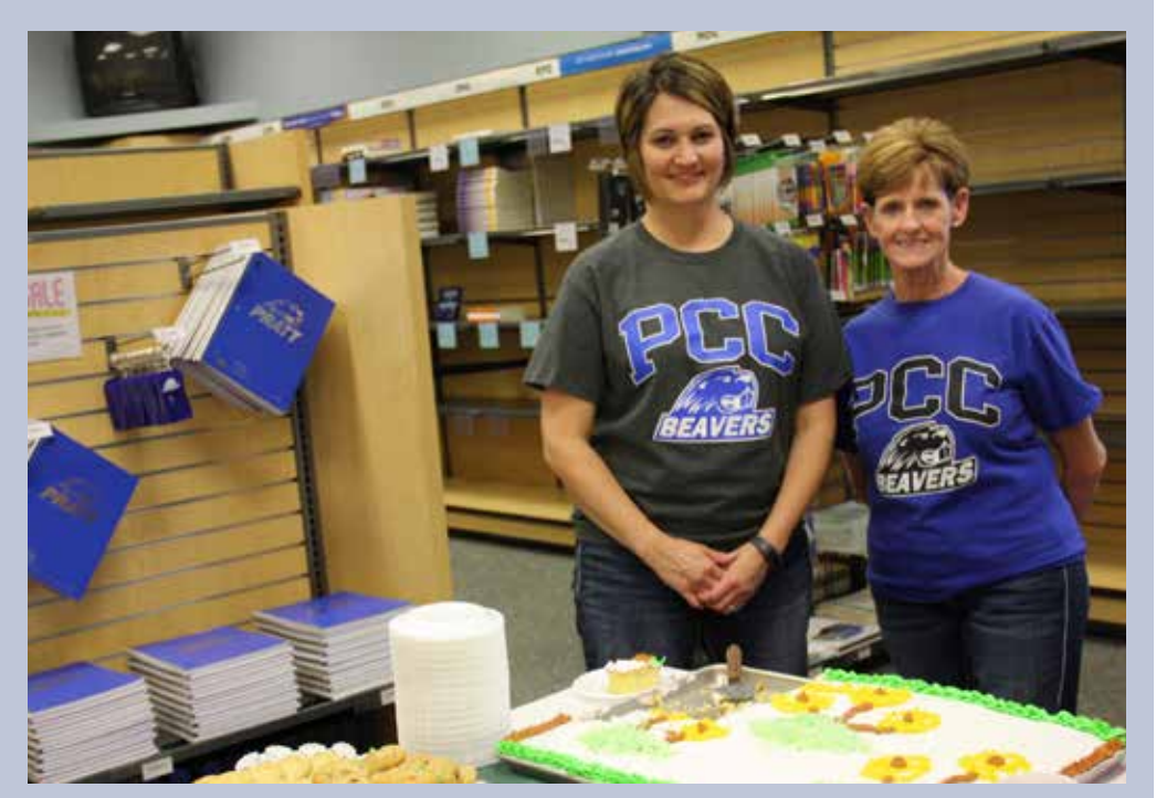
April 22 - The bookstore hosts a cake and punch party celebrating administrative professionals and Earth Day.