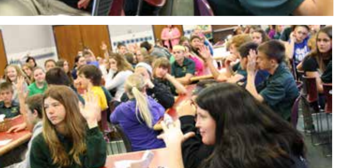
April 10 - Education Support Professionals present a donation to the PCC Foundation for student scholarships