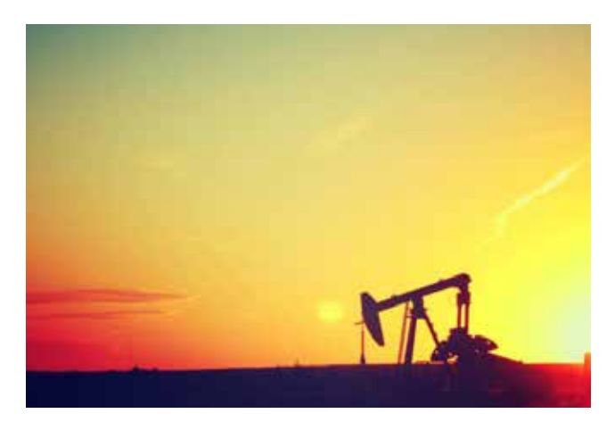
Example of Eggings digital photography