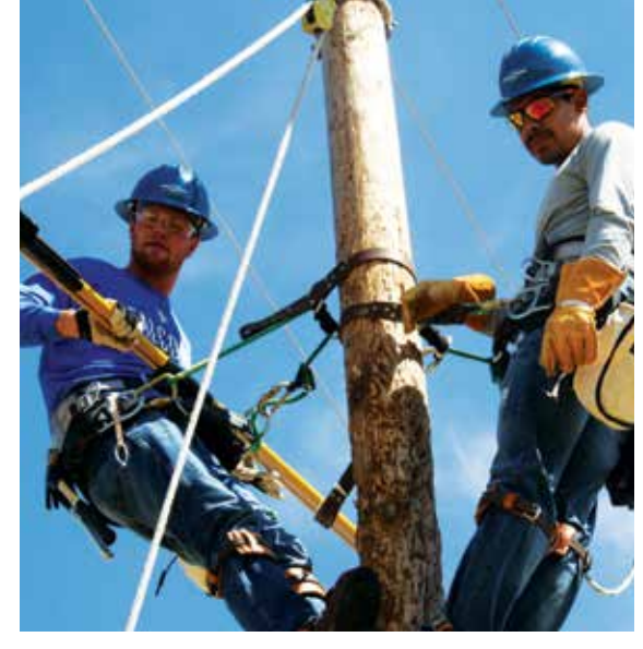
EPT - Hotline school