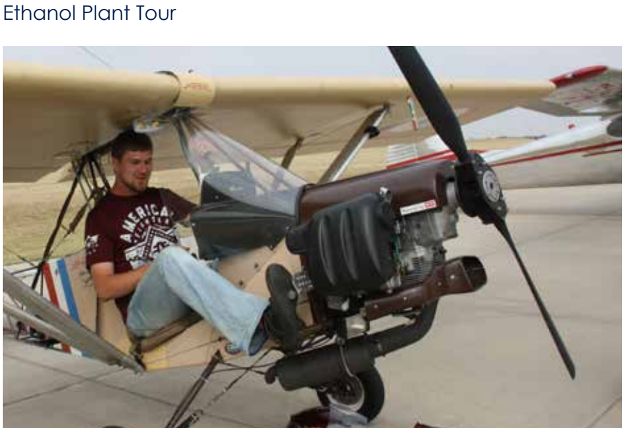
Fly Kansas Air Tour