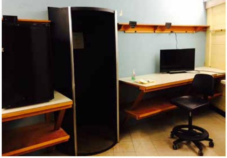
Room 27, Benson Education Center

Lactating mothers interested in utilizing the room can request a key. Access to an electric breast pump for quick and efficient milk removal is currently provided at 100 percent reimbursement through the college's insurance provider, BMI. The room is ready for use and employees who would like to utilize it for their needs can speak to their supervisor.