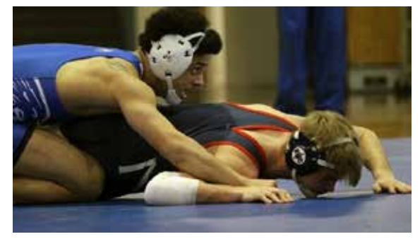
On Feb. 13, Pratt Community College Wrestling competed in the West Central District Regionals in Chanute, Kan.

Wrestling qualified eight for the national tournament which is a school record and placed third overall in the tournament.